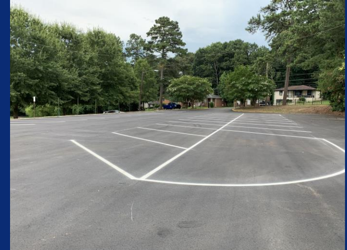
Striping of Parking Lots