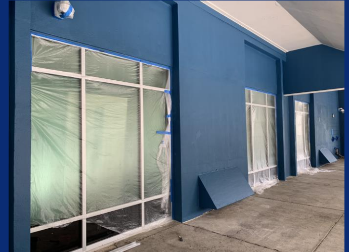
Final Painting of South Elevation