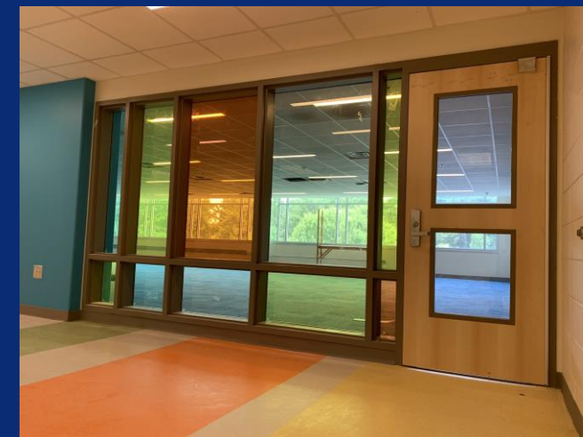
Installation of Colored Glass