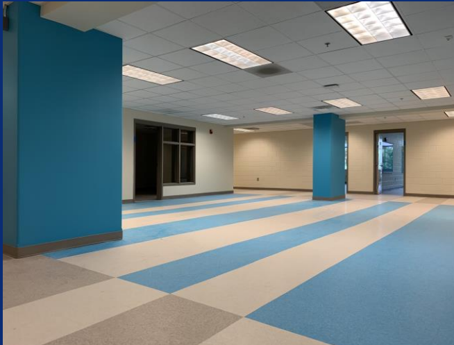
Accent Columns in Area A