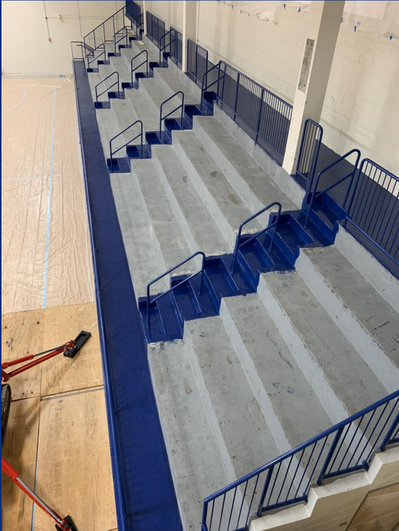
Installation of Epoxy Flooring in Gymnasium