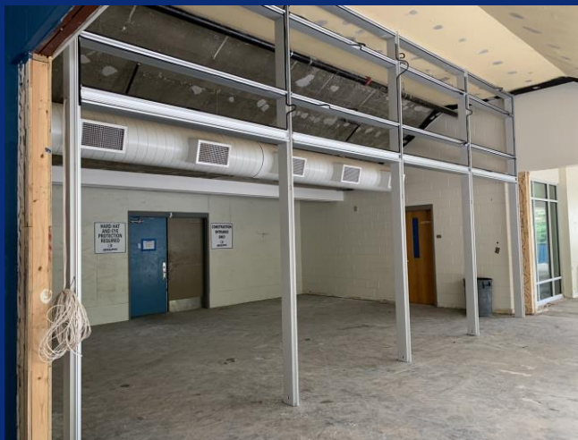
Installation of Curtainwall at Main Entrance